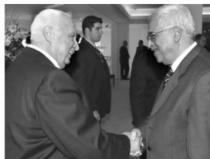
Israeli Prime Minister Ariel Sharon (L) shakes hands with Palestinian President Mahmoud Abbas during their meeting at Sharm el-Sheikh.

The gestures on both sides reflect a dramatic brightening of prospects for Middle East peacemaking since the death of Yasser Arafat and the advent of Mahmoud Abbas.