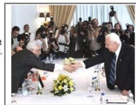
Palestinian President Mahmud Abbas and Israeli Prime Minister Ariel Sharon shake hands at summit in Egypt where they announced a ceasefire between the two sides.

Meeting face-to-face at a landmark summit in Egypt following a new U.S. peace push in the region, both leaders said it was time to end the cycle of bloodshed which has claimed some 4,700 lives, reports Agence France-Presse (AFP).